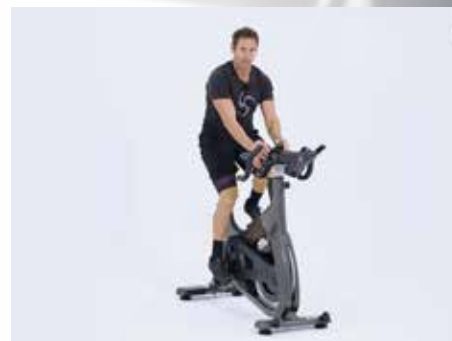
INSTRUCTIONAL VIDEO SERIES